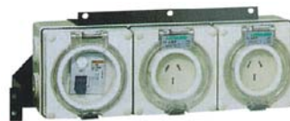
56C310/2 RCD/2P 250V 10A 2 Gang Surface Socket Outlet with RCD Protection Ip56