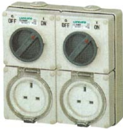
56C313/2 250V 13A 2 Gang Surface Switched Socket Outlet