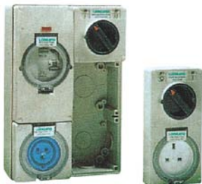
9566/E+9569/L9561/2L+ 9561/L+9570/2+224/030 Multi-gang enclosure any combination