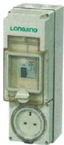
56C313RC 250V 13A 1-2 Round pins surface mount -30mA RCD protection