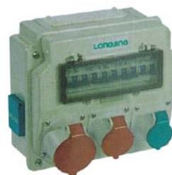
UK215/125 Rated current: 50A Switch: 32A 1,16A 2, 10A 2 Socket 32A(3,4,5pole) Socket 16A(3,4,5pole) Socket 10A(3,4,5pole)