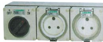
56C315RPH2 250V 13A Twin Gang Surface Switched Socket Outlet(Horizontal Mounting)