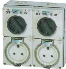
56C315RP/2 250V 13A 2 Gang Surface Switched Socket Outlet