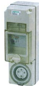
56C410RC 500V 10A-4 Round pins surface mount-30mA RCD protection